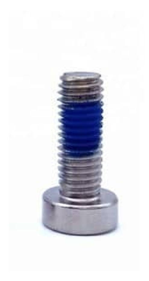
Vention First Release

To measure the performance of zinc-plated fasteners, we had to conduct two tests: one of bare zinc-plated fasteners, and one with a locking patch on the zinc-plated fasteners. This allowed us to isolate the two variables (the first being the change in surface treatment from black-oxide to zinc, and the second being whether or not there was a locking patch).