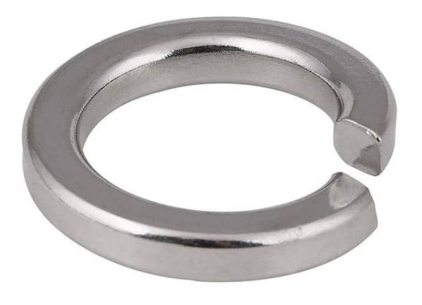
Vention First Release

The split washer works in two ways: first, its spring shape helps maintain the fastener's preload. Second, the sharp edge of the split washer digs into the parent material to prevent the fastener from unscrewing.