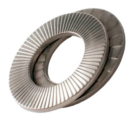
Vention First Release

The Nordlock washer is a two-piece wedge style washer. Each half of the washer has two serrated surfaces: fine serrations on the outside, and larger wedge-shaped serrations on the inside. The fine serrations dig into the parent material when the fastener is torqued. This prevents the washers from slipping against the bolt or joint's surface.