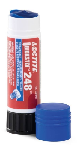
Vention First Release

Loctite, one of the most common anti-vibration methods, is an anaerobic adhesive that works by gluing the male and female threads together. It's available in many different strengths, from light to permanent. Loctite 248 is a medium-strength adhesive that comes in a convenient stick format. The manufacturer recommends using it with the Loctite 7088 primer.